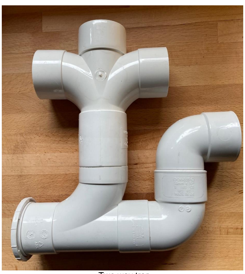
Two way trap

The RH socket leads to a urine drain. This could be a mains sewer or onsite soakaway for urine. The vertically directed socket leads to a 110mm pipe and the AirFlush fan. The socket pointing to the L connects to the urinal/s. Below this is a screwed access cap for cleaning out.