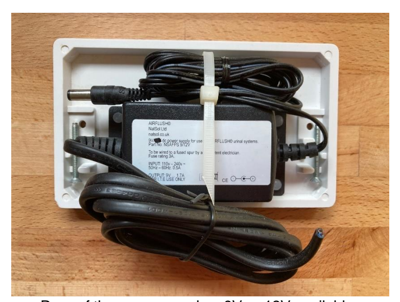
Rear of the power supply – 9V or 12V available

The fan lead comes out through the side of the 110mm housing and has a push fit connection to the power supply lead. The connection should be kept dry. The mains lead on the power supply must go to a fused spur.