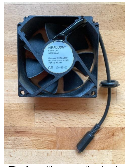
The fan with connecting lead

The fan can be replaced through the screwed access cap on the side.