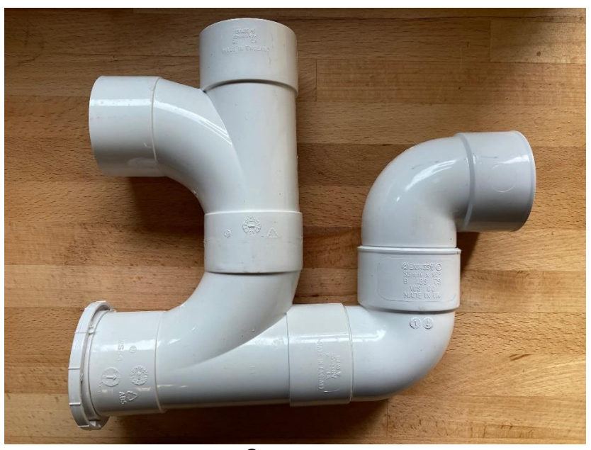
One way trap

The RH socket leads to a urine drain. This could be a mains sewer or onsite soakaway for urine. The vertically directed socket leads to a 110mm pipe and the AirFlush fan. The socket pointing to the L connects to the urinal/s. Below this is a screwed access cap for cleaning out.