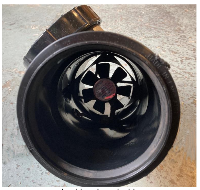
Looking down inside

The fan can be replaced through the screwed access cap on the side.